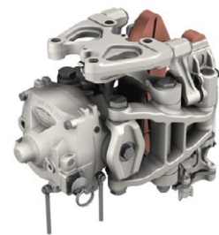
AMD Service & Parklock® Parking Brake Station