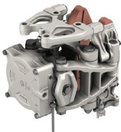
AMD Service Brake Station

A modular system made of AMD and WMD calipers plus 3 types of cylinders (Service brake, Service + Spring parking, Service + Parklock®)