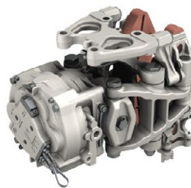
AMD Service & Spring Parking Brake Station